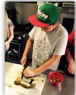
2015 Summer Program Workshops