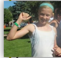
2015 Splash & Dash